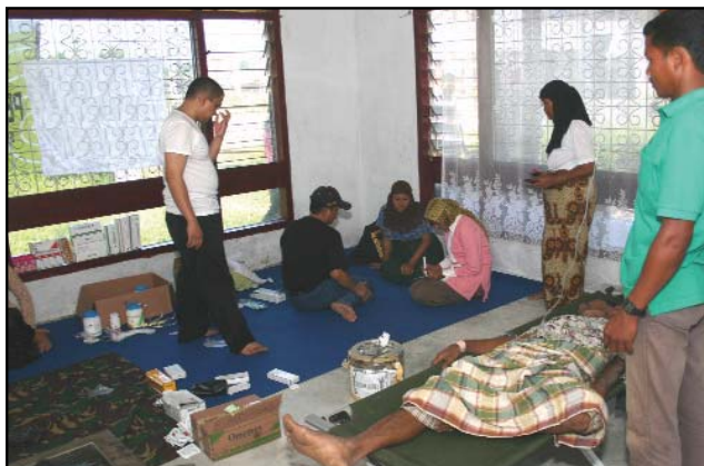
Medical aid reaches Lam No. (right)