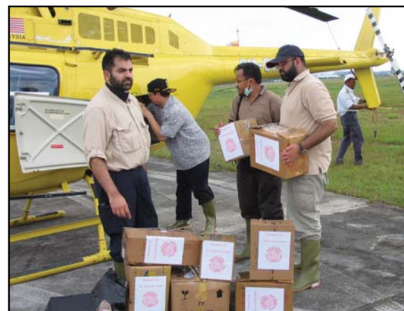
Medical aid flown into Lam-No. Aceh ▷