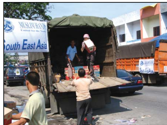
Trucks of food & water leave for Aceh. Medan ▷