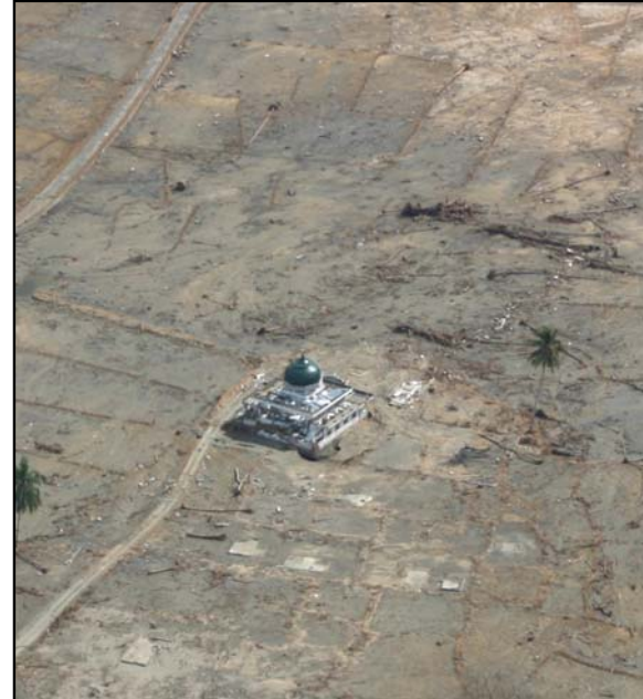
Entire Aceh District Devastated ▷

There were many areas of Aceh, along the West Coast, from Banda Aceh in the north to Melabou in the south, that received "First Contact" after 10 days - i.e. were reached by rescue teams for the first time since the disaster. How these people survived is a testimony to their courage. We have heard first hand reports of people forced into eating raw beef and drinking seawater. Many have died soon after, from 'Secondary Drowning Syndrome' and infections caused by untreated wounds. (continued. page 2)