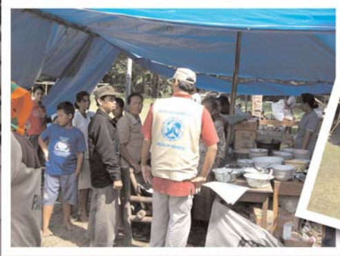
Medical care and food aid camp