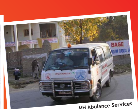
MH Abulance Services