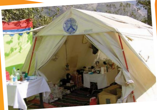
Medical Aid Tent: Field clinics running from tents at various camps