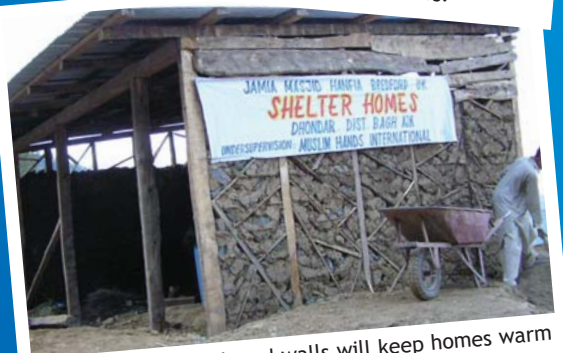
Stone and mud walls will keep homes warm