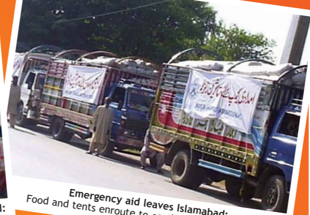
Emergency aid leaves Islamabad: Food and tents enroute to earthquake zone