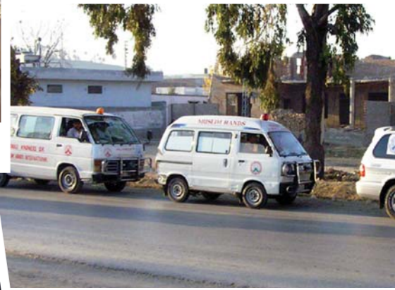
MH Ambulance Units already in the region operating in earthquake zone