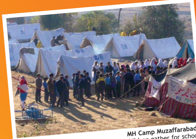
MH Camp Muzaffarabad: Children gather for school

Provision of Excavators and Dumpers: Muslim Hands is providing 5 excavators and 10 dumpers for the clearing of Muzaffarabad.