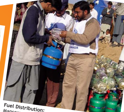
Fuel Distribution: Mansera