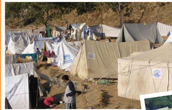
MH Camp Baag: Camps of various sizes set up