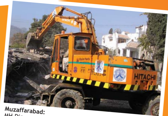
Muzaffarabad: MH Diggers & excavators clearing Rubble