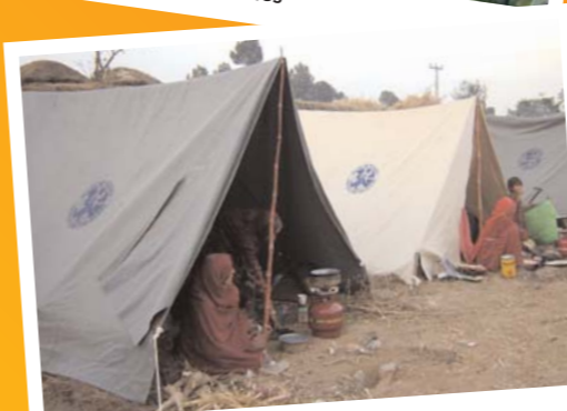
Tent Distribution: Over 4000 tents already distributed