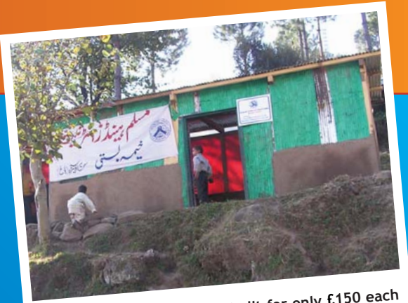
MH Shelter Home built for only £150 each

Over 2000 homes have been commissioned already.