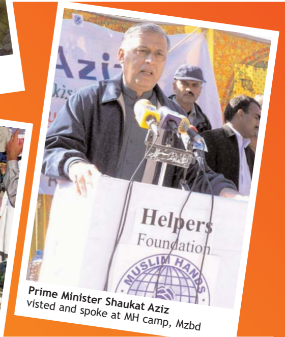
Prime Minister Shaukat Aziz visted and spoke at MH camp, Mzbd