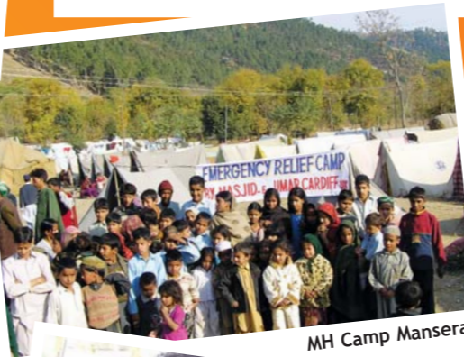
MH Camp Mansera