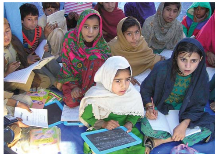
Temporary Schools at MH Camps: MH camps run classes to help bring some 'normality' to their lives