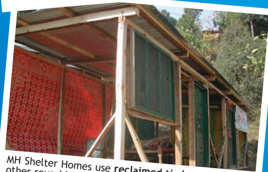
MH Shelter Homes use reclaimed timber and any other reusable items e.g. doors & windows.