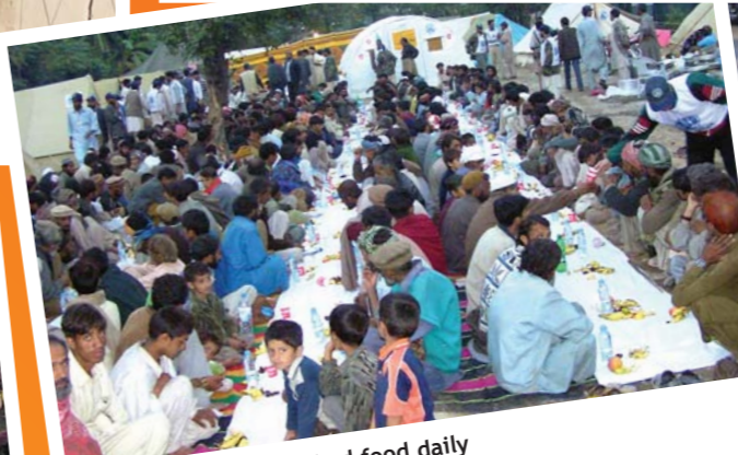
MH Camps provide cooked food daily