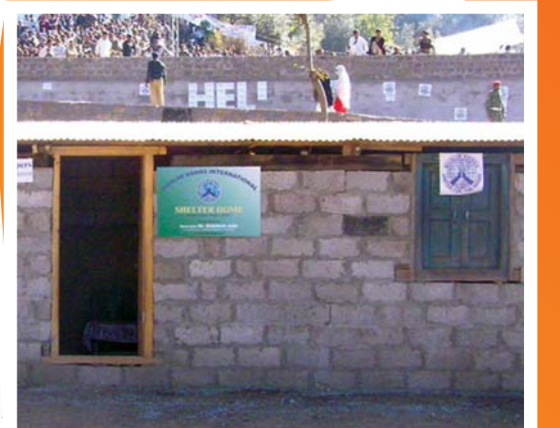
Shelter Home MH building homes from reclaimed material