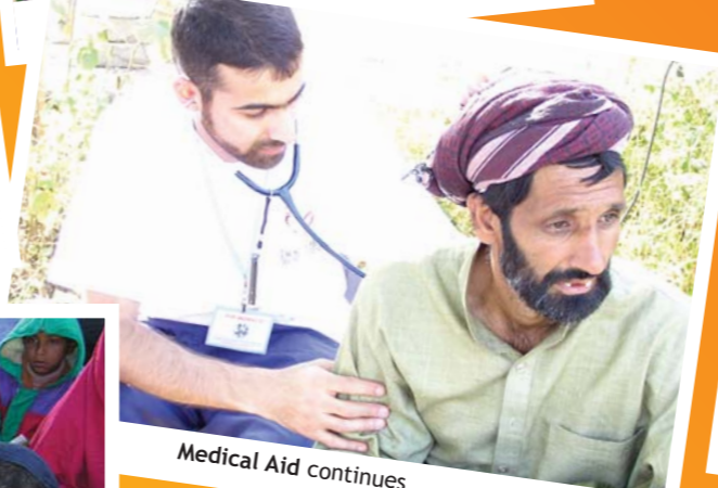
Medical Aid continues