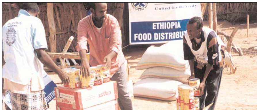
Food distribution in Gode, Harkali and Harmukali (below)