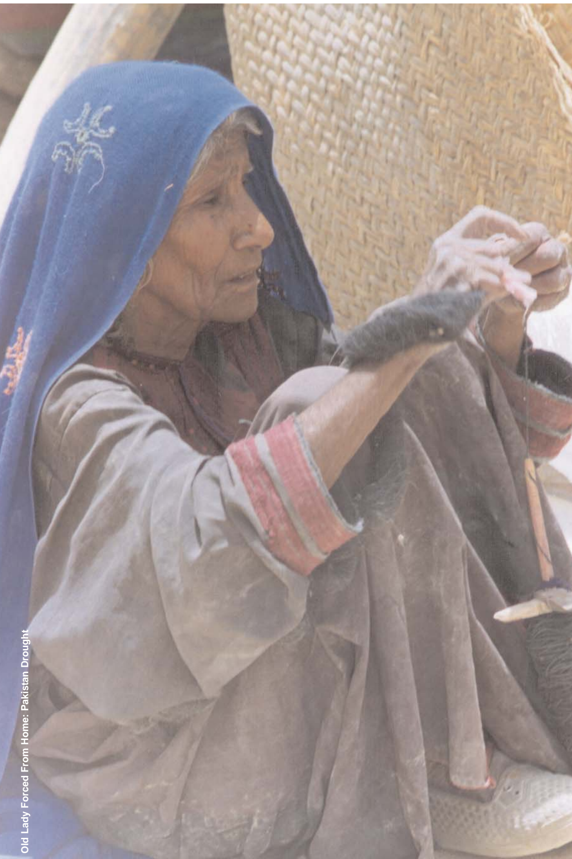
Old Lady Forced From Home: Pakistan Drought

CHECHNYA Food, clothing and schools for the war-torn Chechen refugees 2