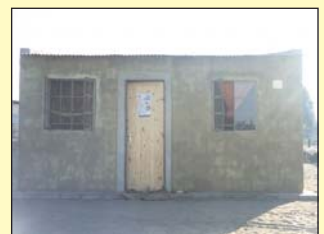
Low cost housing