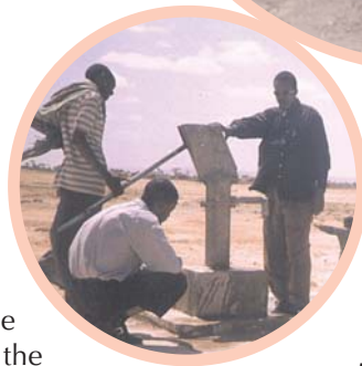
New well project (left)