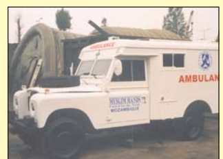
Ambulance Units, Gaza