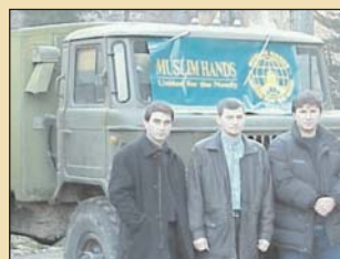
Caring for sick and injured in Tbilisi hospitals (centre)