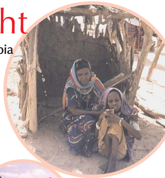
Old & homeless (top)

Medical clinics for the south-eastern region are also planned. Besides offering basic medical care for the community, that all Muslim Hands clinics provide, these clinics will also provide veterinary services for live-stock. This is imperative, as the link between human lives and the lives of their cattle is quite profound. Provision of shelter is also a high priority for this region. (see Shelter report on page 7)