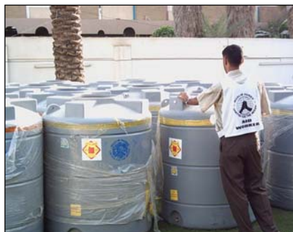
Baghdad: Water storage for homes

In February and May 2005, MH organised capacity building and management training programmes for Iraqi aid organisations and NGOs. The training courses held in Baghdad and Amman, Jordan were attended by twelve Iraqi organisations.