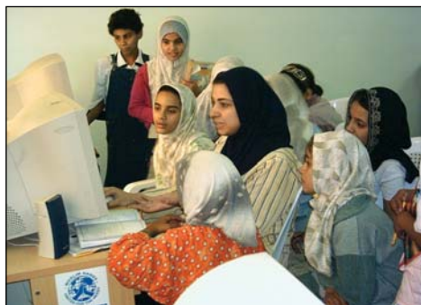
MH continues supporting orphanages in Iraq