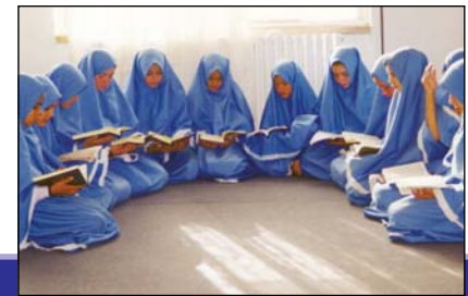
Al-Khalil (Hebron): Study circle