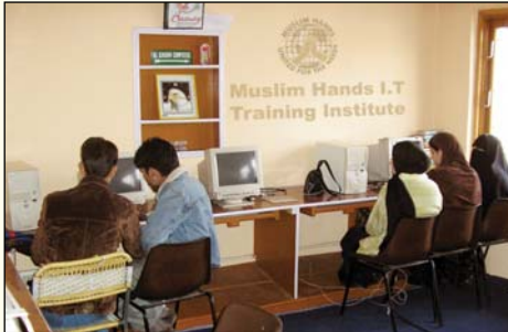
MH Computer Training Institute for Orphans, Srinagar

clampdowns and a collapsed economy. MH has been working in Kashmir (on both sides of the border) since 1994. From the setting-up of blood-banks in Kapwara, Baramullah and Rajory to the running of medical clinics along the LoC, numerous other development projects have been started in Kashmir over the past few years.