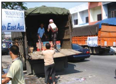
Trucks of food aid leave for Aceh, Indonesia

The earthquake and the consequent tsunami wave which struck South East Asia on December 26th, 2004 was the beginning of the world's worst natural disaster in living memory. Within hours over 300,000 people lost their lives and millions more had been made homeless.