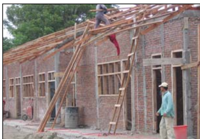
Reconstruction of homes begins, Sri Lanka