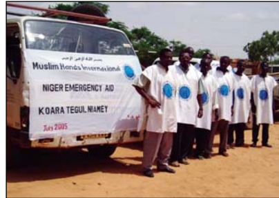
MH teams reach Niger with aid

■ Safe Water: Initially four large ground wells have been dug in the Managa-Ize area, some 100 miles from the capital Niamey.