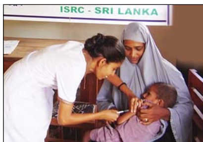
Reduction of Infant Mortality Campaign, Sri Lanka