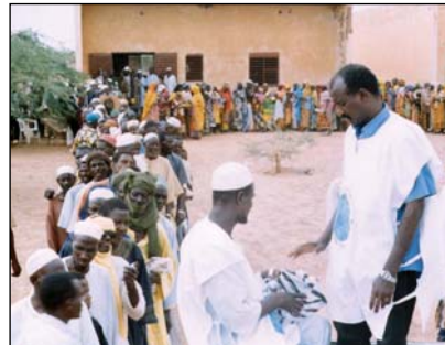
Touah: Distribution of food