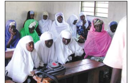
The Gambia: Adult literacy classes