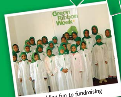
Children adding fun to fundraising