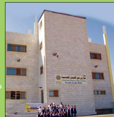
Jerusalem: MH funds Noor Al-Huda School