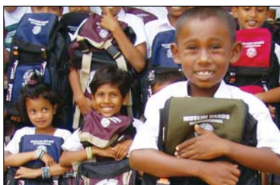
Back to school in Trincomalee, Sri Lanka