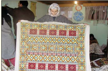
Handicraft Centres help support over 100 widows