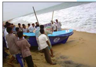
Sri Lankan fishermen launch new MH boat