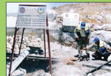
Nablus: Wells for agriculture & domestic use