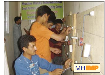
Afghanistan: Job Skills Centre