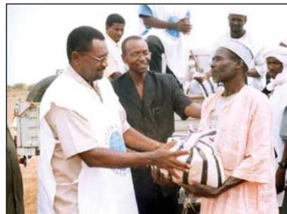
Niamey: Distribution of food