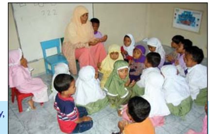
Aceh, Indonesia: School for tsunami victims