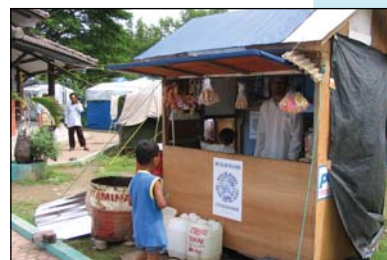
Rebuilding shattered livelihoods in Aceh