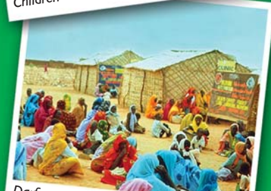
Darfur: medical clinic for young children