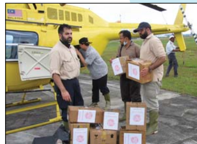
Medical aid flown into Lam-No, Aceh

MHSEA office in Aceh is now overseeing the rebuilding of homes, schools and businesses in the area. In Sri Lanka, alongside rebuilding of homes MH has been providing poor fishermen with fishing boats so they can once again provide for themselves & their families.